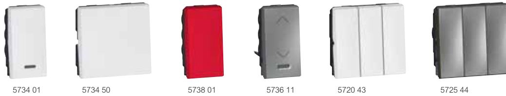
Cover plates selection chart (p. 262-265)