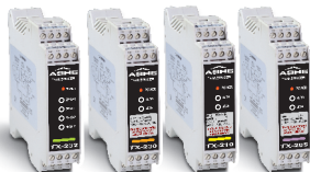
SIGNAL ISOLATORS & TRANSDUCERS