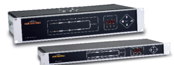
STATIC POWER SWITCHES